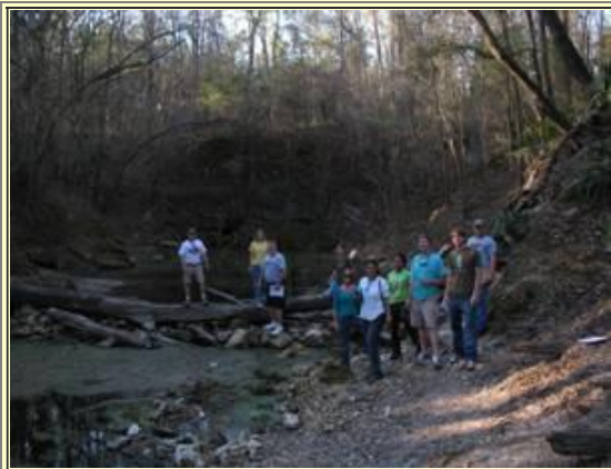
A karst window at Falmouth Springs, FL. The small stream