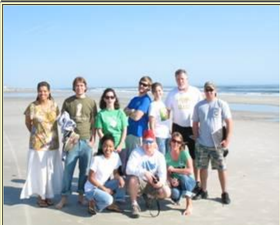
Here the students are at Hanna Park north of Jacksonville Beach, where they learned that a beach has more than two parts.

runs into a cave at the base of the wall behind the students. It begins at a cave spring in the base of a similar wall about 100m behind the photographer. A karst window is a place where a spring appears in one end of a collapsed segment of cave and then disappears at the other end. The water usually ends up in the Suwannee River about two miles away, but when there has been little rain in the immediate area and lots in Okefenokee (or upstream somewhere else) then the river is higher than the groundwater table and the flow reverses.